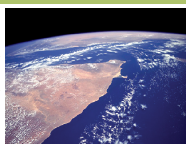
THE OCEAN FROM SPACE. Photograph from NASA's Columbia Orbiter Vehicle shows Somalia in center, South Yemen and the Gulf of Aden toward the top and the Indian Ocean to the right.