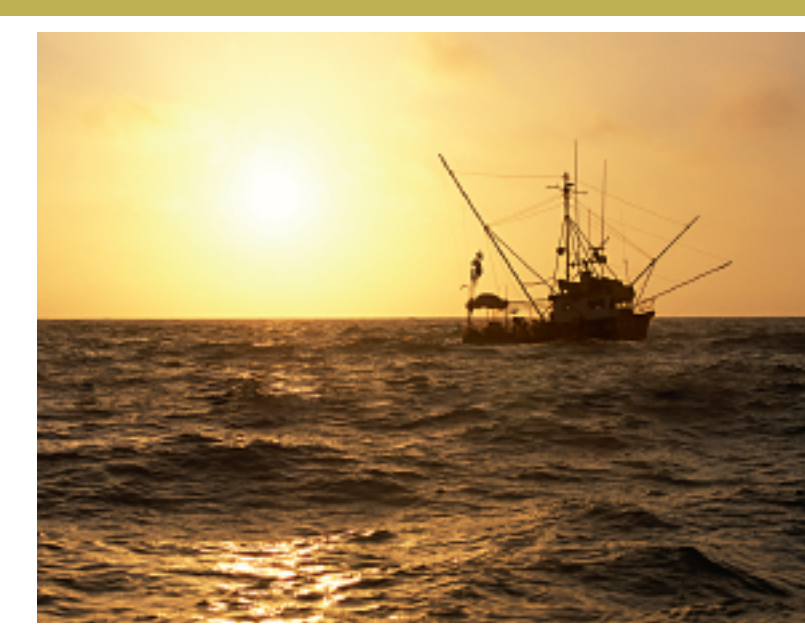
THE DAY'S CATCH. A commercial fishing vessel off the coast of Santa Cruz, California returns to port.