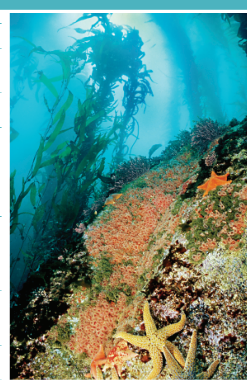
PACIFIC ECOSYSTEM. An ochre sea star makes a kelp forest home in Monterey Bay, California.