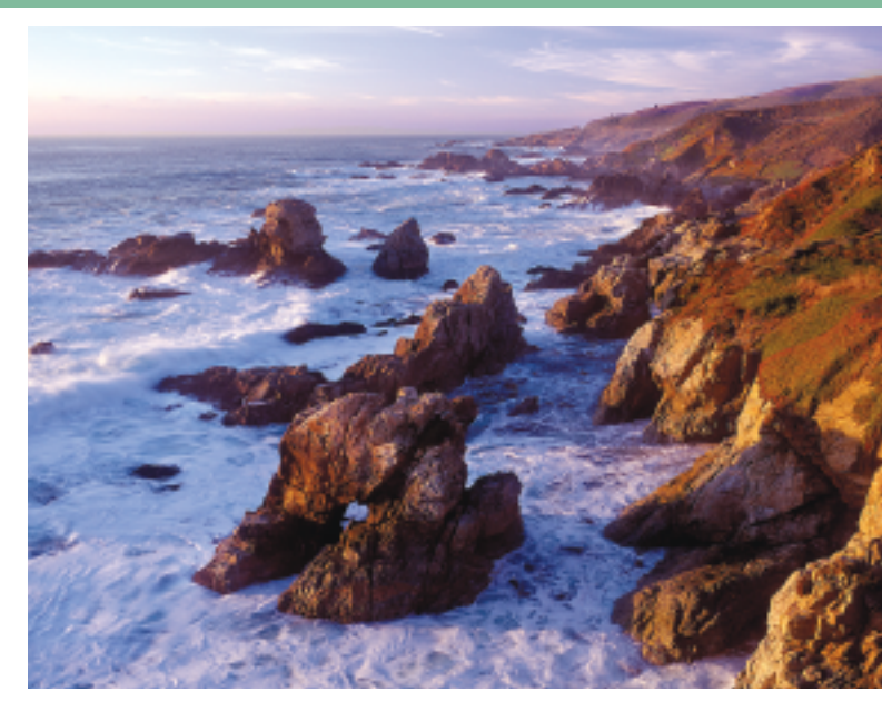
COASTAL CARVINGS. The Big Sur coastline in California is the result of a great geological uplifting, which occurred roughly 30 million years ago.