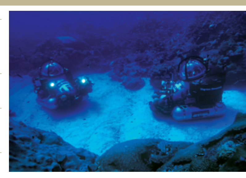
UNDERWATER EXPLORATION. Deep Worker submersibles explore the Flower Garden Banks National Marine Sanctuary in the Gulf of Mexico.